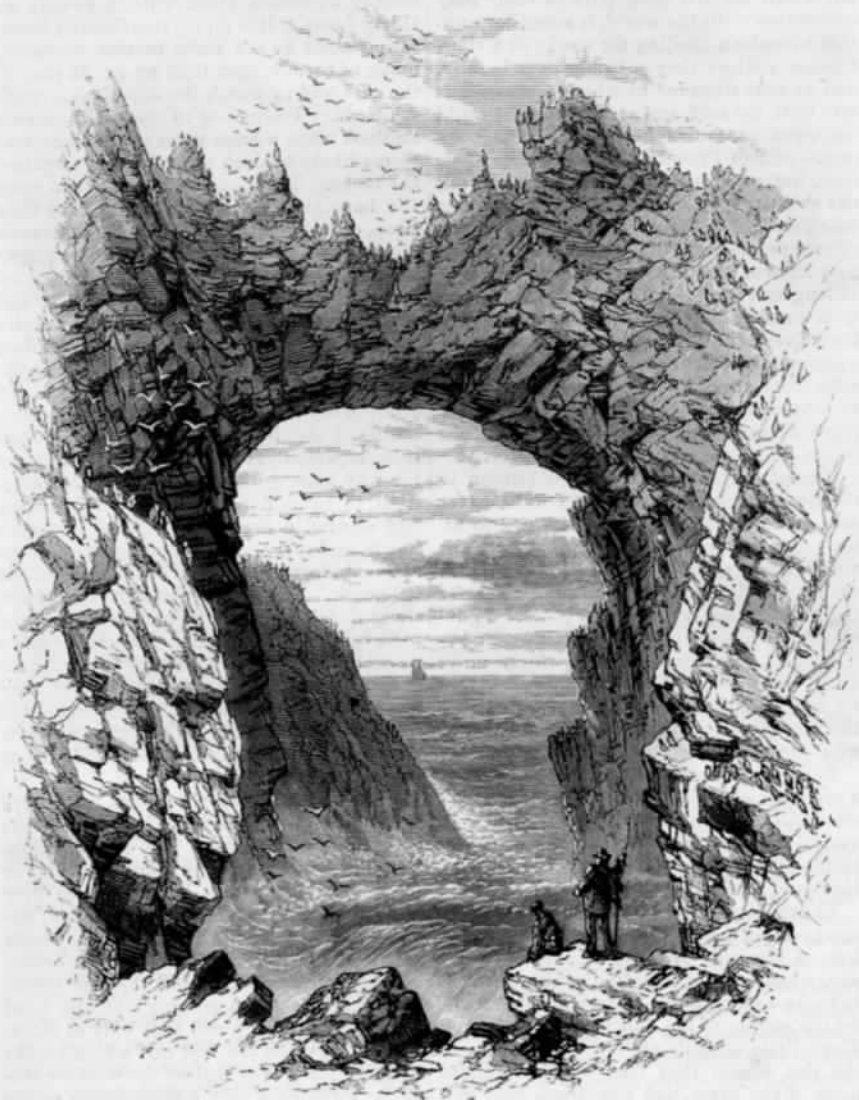
ARCH AT WEST END, FARALLON ISLANDS.

genuity of man. The mouth-piece of the trumpet or fog-whistle is fixed against the aperture in the rock, and the breaker, dashing in with venomous spite, or the huge bulging wave which would dash a ship to pieces and drown her crew in a single effort, now blows the fog-whistle and warns the mariner off. The sound thus produced has been heard at a distance of seven or eight miles. It has a peculiar effect, because it has no regular period; depending upon the irregular coming in of the waves, and upon their similarly irregular force, it is blown somewhat as an idle boy would blow his penny trumpet. It ceases entirely for an